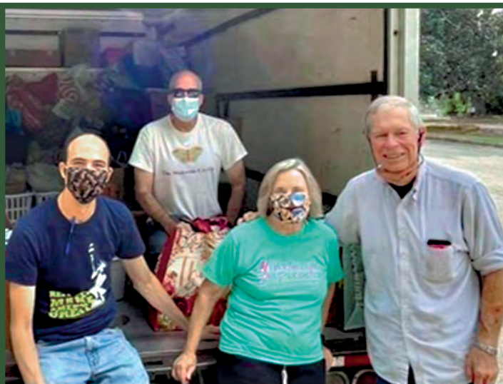
Welcome Kit Drive – Thank you for collecting and donating the items that refugee families need!