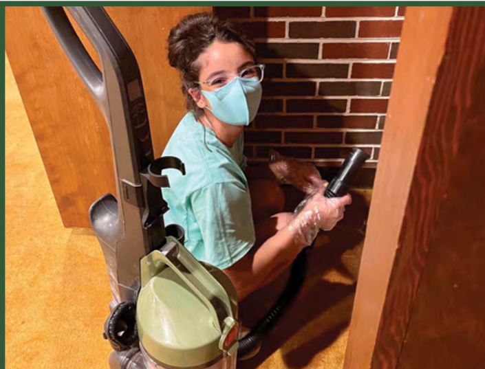
Sanctuary Children’s Room Renovation – Thank you for investing in space to welcome refugees!