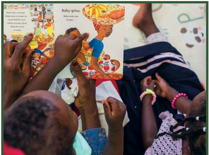
Library & Literature Grant – We began a “Library and Literature” project to purchase more books for our on-campus community!