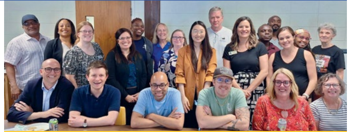
MDM Board & Onsite Partners at a 2025 Partners Meeting.

Over $38,820 was contributed to Partner Support & Community Initiatives in 2025.