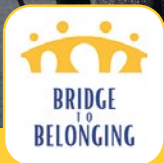
Onsite Partners, Staff, & Honorees at MDM's 2025 Bridge to Belonging event.

"MDM's campus provides a safe, stable, and truly welcoming environment where mothers and children from refugee backgrounds can learn, grow, and build community.